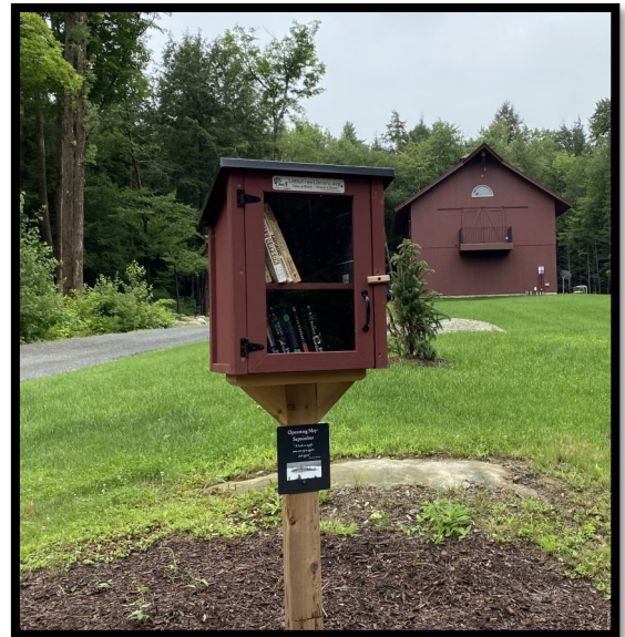
The Little Free Library at 667 Granite Lake Road