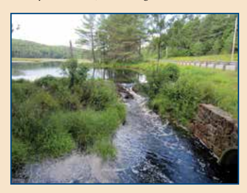
Over the years, beavers have built a dam at the outlet of Nye Meadow which is located upstream of Granite Lake and adjacent to Route 9 in Stoddard/Nelson.

Granite Lake, a relatively high quality water body covering approximately 230 acres, is located in southwest New Hampshire within the towns of Stoddard and Nelson. The mission of the Granite Lake Association, which held its 68th annual meeting during summer 2017, is to "serve Granite Lake's scenic, recreational and environmental interests by promoting the preservation and protection of its water quality and other natural resources." One of the primary ways association members have been working to protect the lake is by taking actions to limit the amount of sediment deposited into the lake. Part of the Granite Lake 2,432-acre watershed is located within the Nye Meadow Refuge, a 45-acre natural wetland managed by New Hampshire Audubon. The wetland system, a prime source of fresh water for Granite Lake, is home to a variety of wildlife, including beavers and