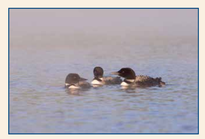
Mother and Father loon and a friendly visitor in the rising fog on Pleasant Lake in New London one September morning.