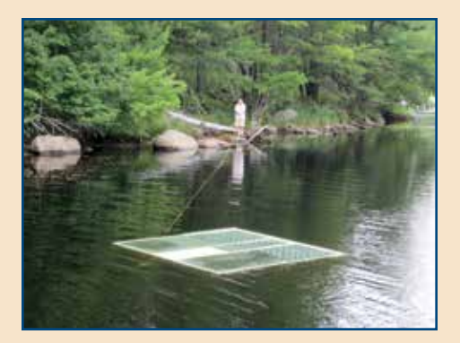
Members of the Granite Lake Association helped install a flow-control device to maintain the water level in Nye Meadow.

To learn more about this project, visit the Granite Lake Association website at granitelakenh.org/projects .