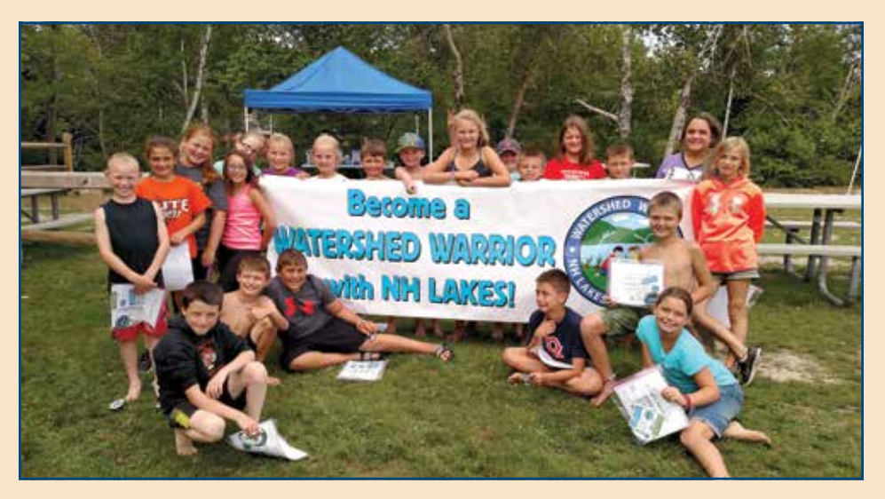
The NH LAKES Watershed Warrior Program visited the Newport Day Camp at Sunapee State Park Beach on a beautiful day in early August.

See You Next Summer? If you are looking to help foster the next generation of lake stewards in your community, contact NH LAKES to schedule the Watershed Warrior Program for your town event, community festival, or youth camp!